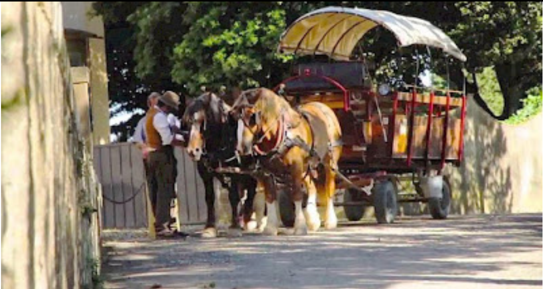
Luca making the last minute preparations for a horse and wagon excursion through Chianti

Luca spends as little time as possible on tar-sealed roads and even then on roads with little traffic. Most of the time we travelled over Tuscan strade bianche (dirt roads) among the vineyards and olive groves. We took a full day tour and so stopped off for some wine tasting during the morning at one of the wineries near Montespertoli and San Casciano, and we had lunch at a farm house in their fine old kitchen. During the afternoon we continued our explorations with a stop at a castle (a small castle or a large fortified villa - both descriptions fit!). Altogether it was a wonderfully relaxing day.