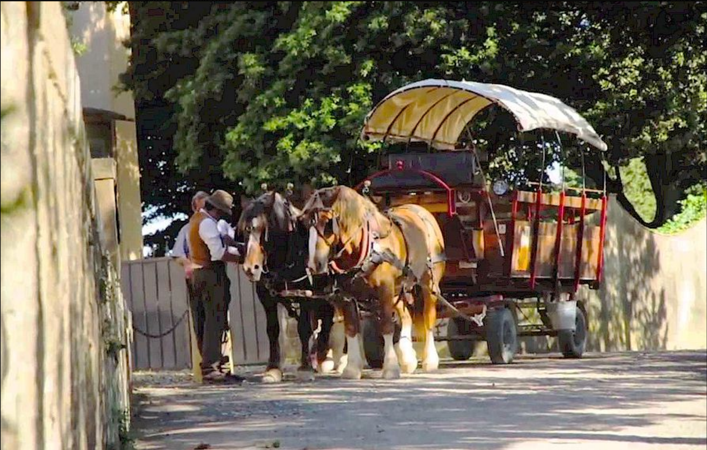
horses very strong and beautiful. Off we go!